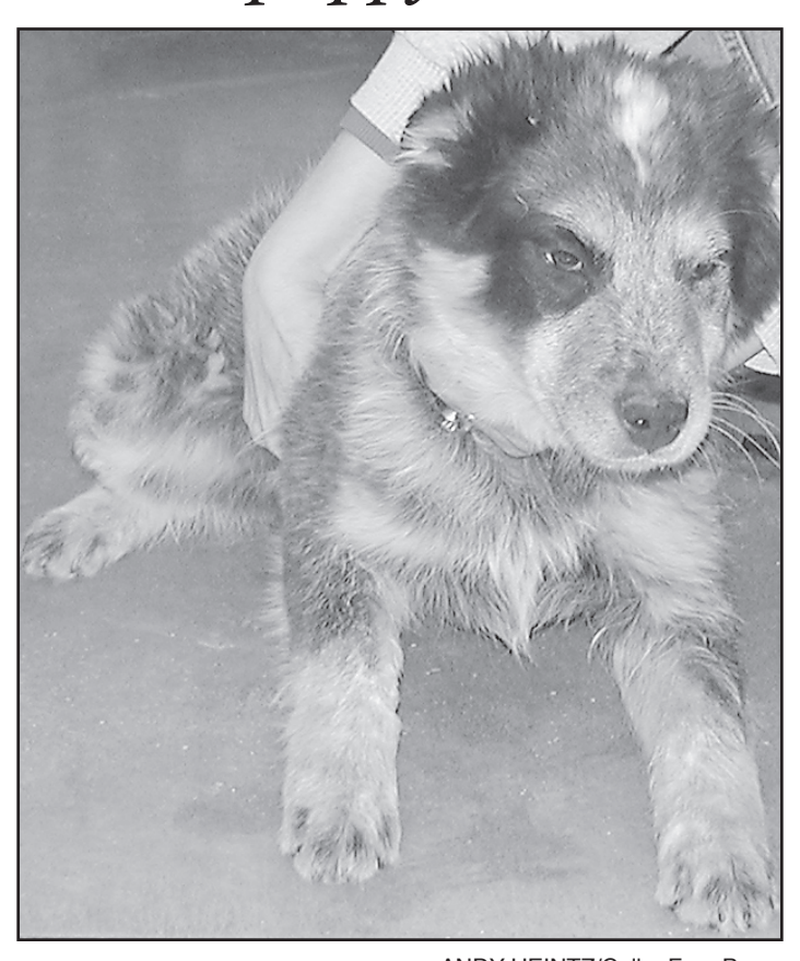
Looking for a pet? Colby Animal Clinic has this male blue heeler puppy, 3 to 4 months old, available for adoption. Call or stop by 810 E. Fourth St. All animals have current shots, and costs are minimal. For questions, call 460-8621.