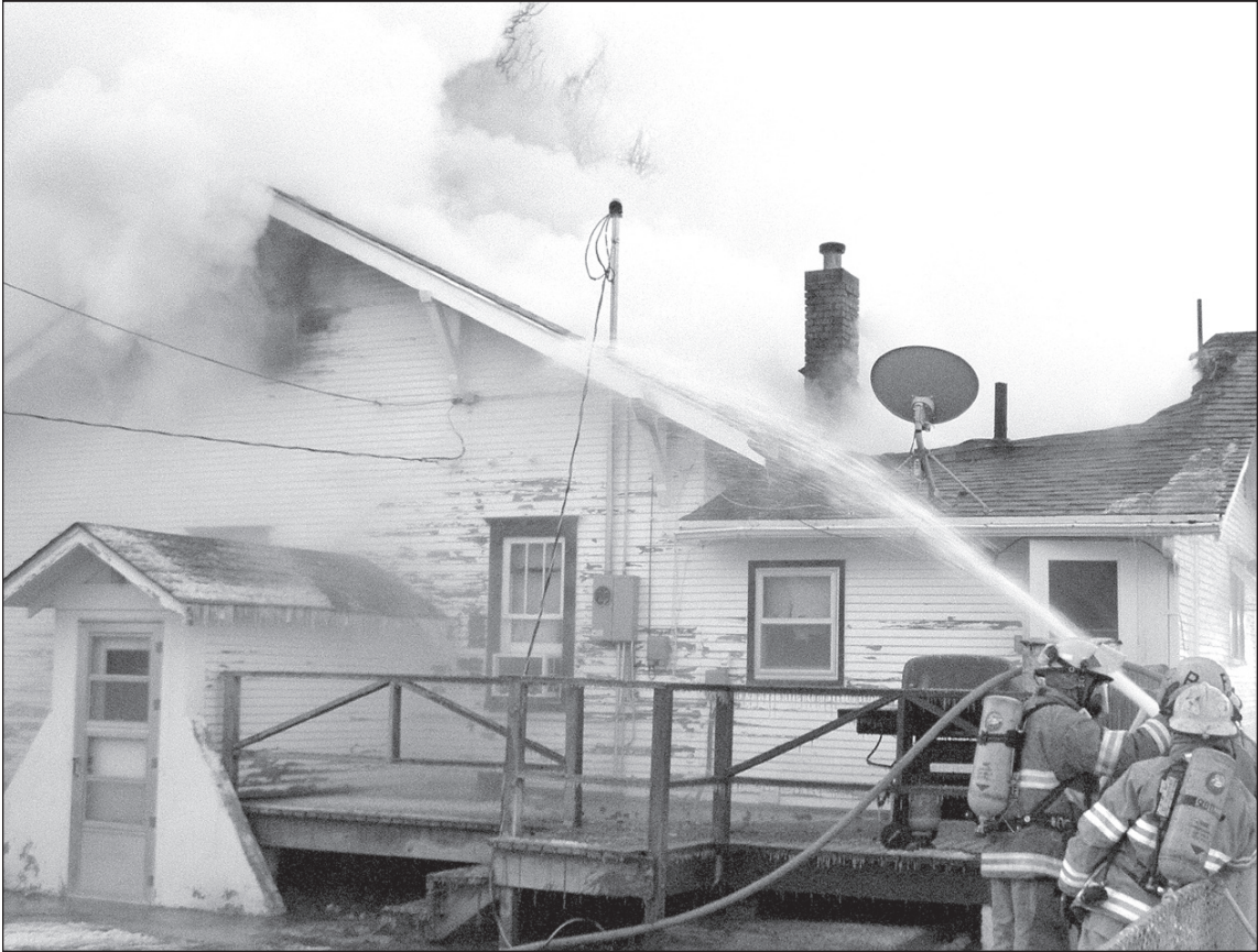
City of Goodland firefighters and Sherman County Rural Fire Department firefighters fought a fire from 5:40 a.m. to 12:19 p.m. at 224 E. 11th. The fire was thought to be electrical in origin. Eagle Med crews used the house for lay overs.