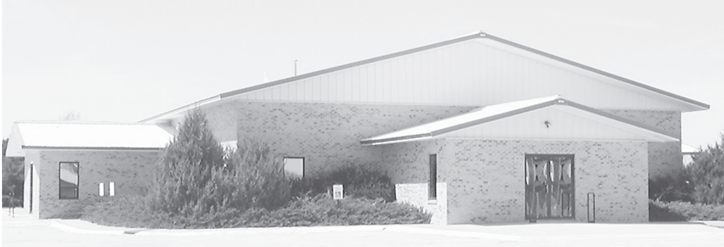
BEREAN CHURCH, 1000 S. Franklin, 460-2763, www.colbyborean.com; Sunday School 9:30 a.m., Sunday Worship 10:45 a.m. Awana Clubs, Wednesday, 7 p.m., Middle & High School, Wednesday, 7 p.m. @ the Heartland Christian School Gym.

Worship in the church of your choice this weekend.