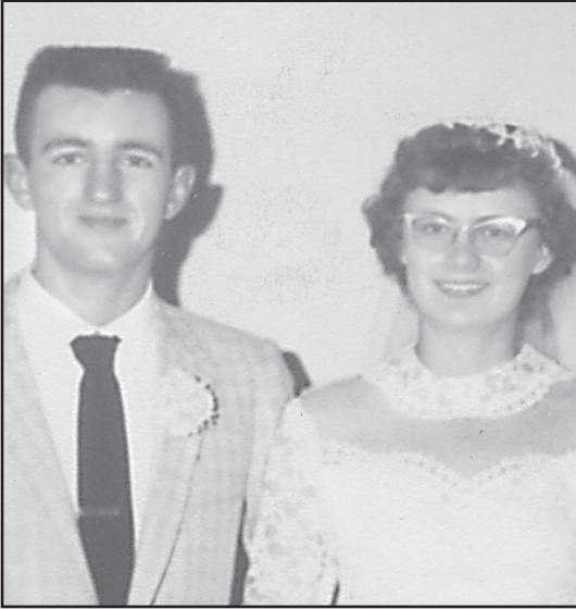
The Wancuras then.