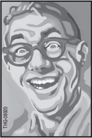
Go Tom Go