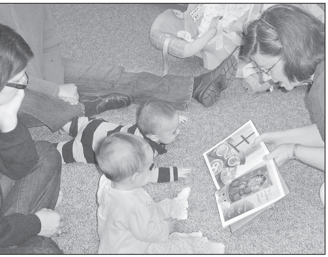
A reading program especially for preschool children at the Pioneer Memorial Library is getting help from Smart Start Northwest Kansas.