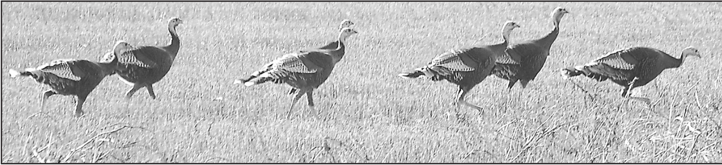
A flock of wild turkeys roamed the countryside of rural Logan County, southwest of Colby, on a bright sunny Sunday afternoon last weekend. The gobblers were on the Logan wildlife area near Russell Springs.