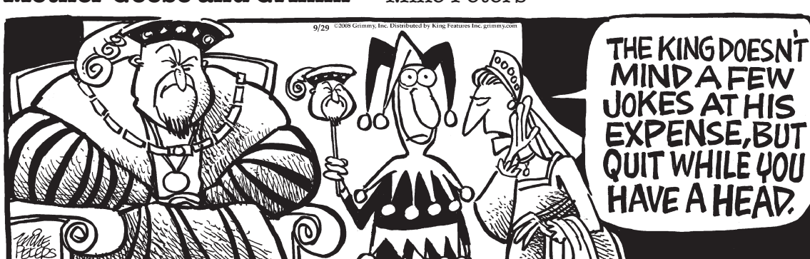
JOKES AT HIS EXPENSE, BUT QUIT WHILE 400 HAVE A HEAD.