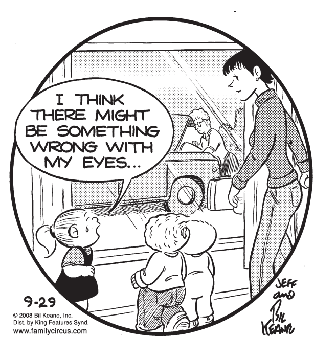
... whenever I see Grandma packin' to leave, they get all watery."