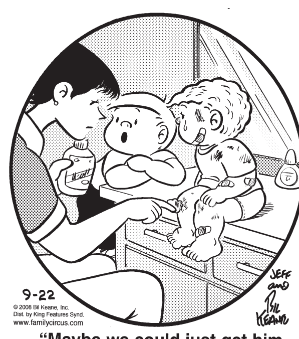
"Maybe we could just get him bubble-wrapped.'