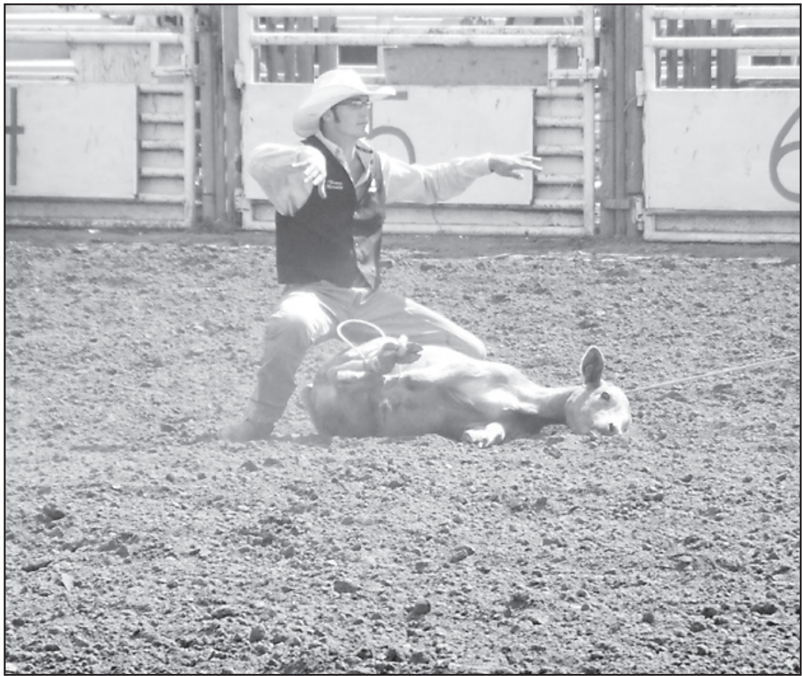
Twenty-four colleges in two states will be in Colby Friday, Saturday and Sunday for the 11th annual National Intercollegiate Rodeo Association at the Thomas County fairgrounds.