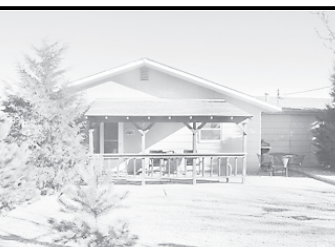
8ac NW of Colby - NEW PRICE - $148,500

CHECK OUR WEB SITE FOR ADDITIONAL LISTINGS!