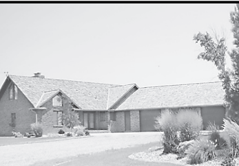
COUNTRY HOME ON 240 AC 1047 CR 25 - Colby