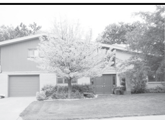
424 Smith Dr - $210,000

NORTON CO: 240 ac grassland SW of Norton- JUST LISTED!!