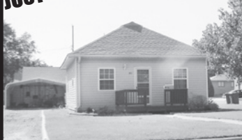
810 S. Garfield - $53,000