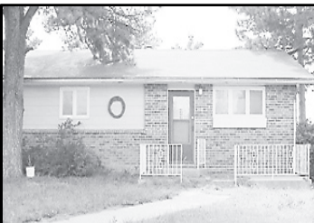
810 N. Country Club - $59,900