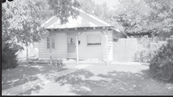
185 S. Franklin - $29,500