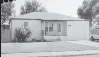
1240 W. 5 th - $62,000