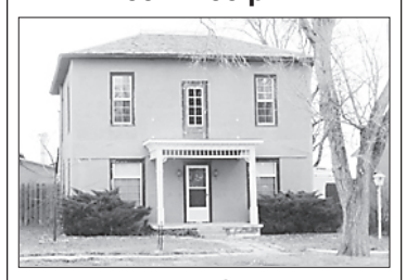
685 N. Court MAKE AN OFFER!