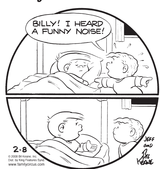
"If the noise was funny, why aren't you laughing?