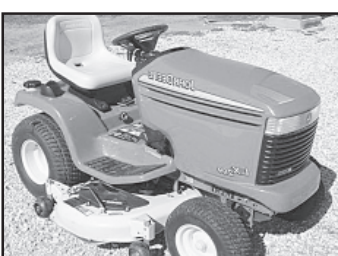
JD LX 289 w/48" Deck $3,500