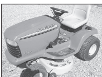
JD LT 160 w/42" Deck $1,950