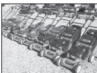
Nice Selection of Walk Behind Mowers