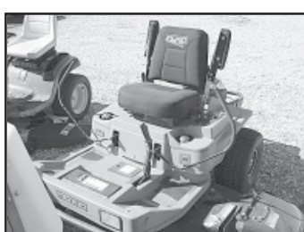
Dixon 5020 w/50" Deck