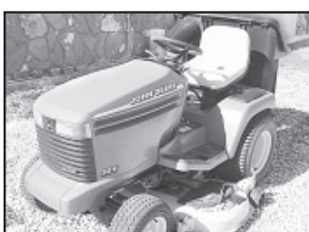
JD 345 w/48" Deck and Power Flow Bagging System $6,500