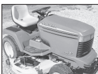
JD GX 345 w/54" Deck $6,500