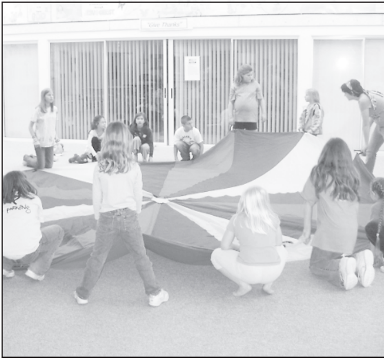
Girl Scouts participated learned a game and a dance during a sleepover last month for Girl Scout Week at the Colby United Methodist Church. The event coincided with the Sunflower Council's 50th anniversary