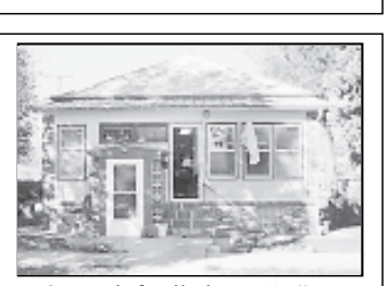
One unit family home "or" an up/down duplex. You decide. Detached 2 car grg w/storage. $65,000 335 W. 6th