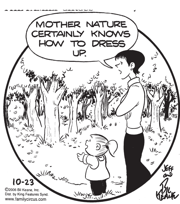
"Yes, Mommy. I love her Fall wardrobe."