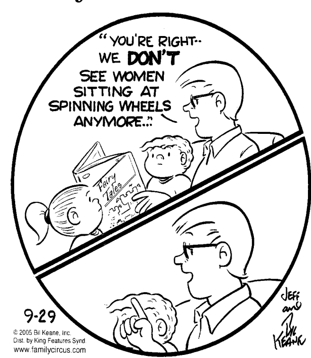
"... unless they're in casinos."