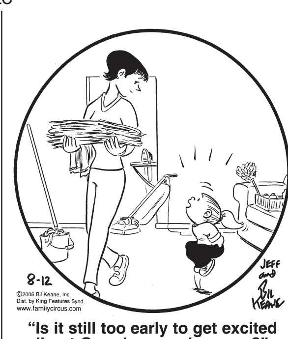
'bout Grandma coming over?"