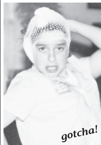
From: Uncle Aaron and Aunt Pam