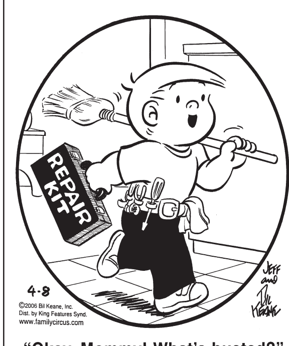
"Okay, Mommy! What's busted?"