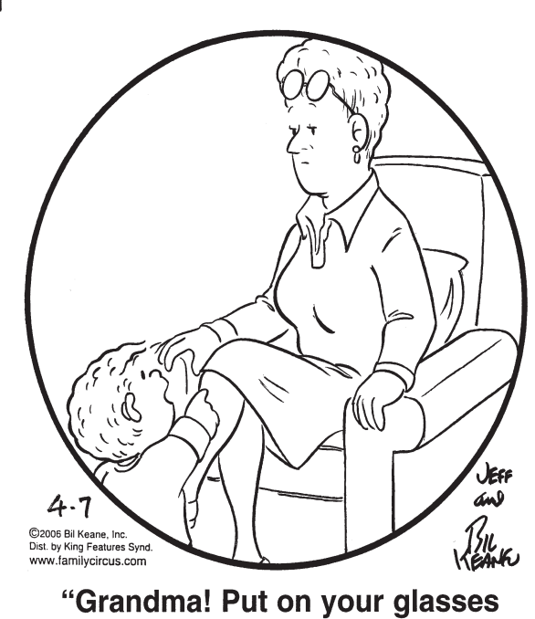
so I can see you!"