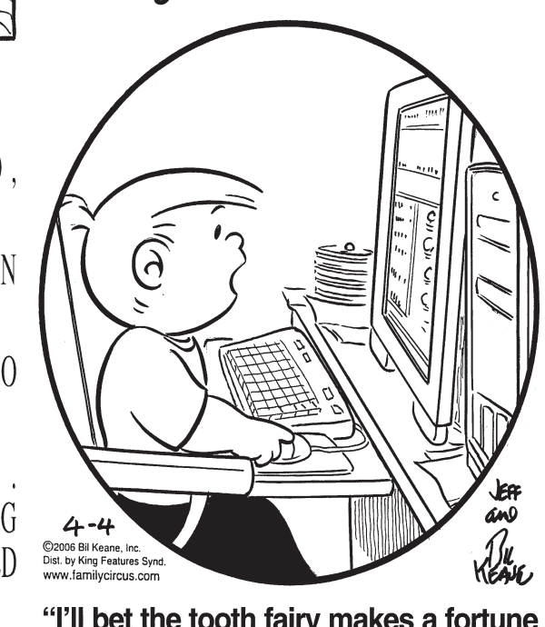
"I'll bet the tooth fairy makes a fortune selling baby teeth on eBay."