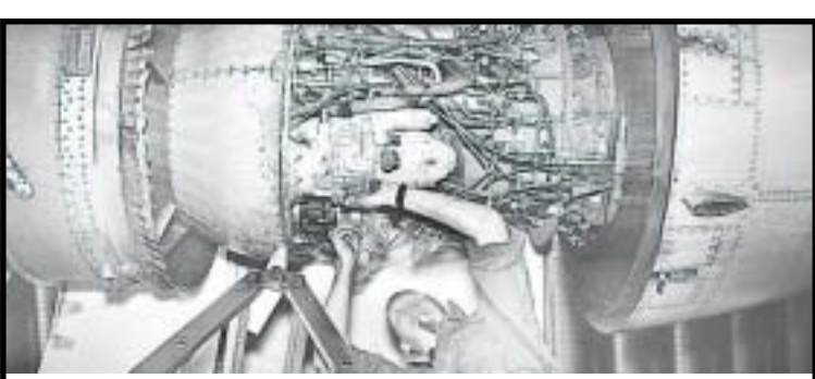
NOT EVERYONE IN SHOP CLASS ENDS UP UNDER A CAR.

Some end up under an F-15 Eagle or an A-10 Thunderbolt II. Some end up as mechanics working on the most advanced applied technology in the world. In fact, the United States Air Force can put mechanically inclined people into roles they could never find in the ordinary world, with opportunities for growth both personally and professionally. Call 1-800-423-USAF or log on to airforce.com.