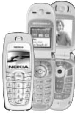
Nokia 6010, Motorola V220 and Motorola V505