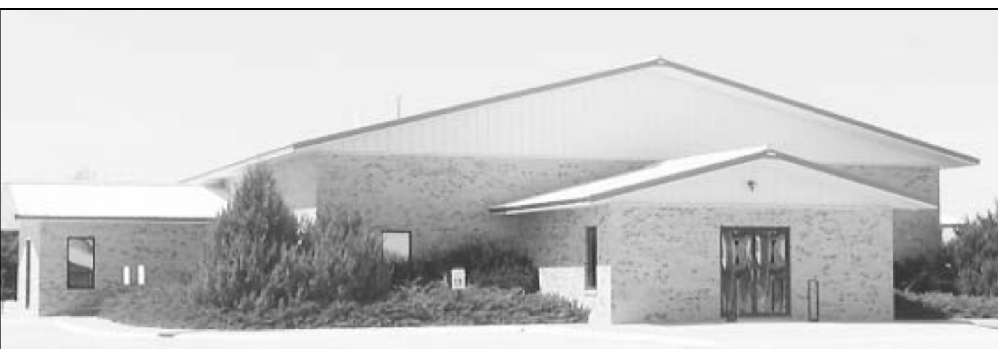
BEREAN CHURCH, 1000 S. Franklin, 460-2763, www.colbyberean.com; Sunday School 9:30 a.m., Sunday Worship 10:45 a.m. Awana Clubs, Wednesday, 7 p.m., Middle & High School, Wednesday, 7 p.m. @ the Colby Armory