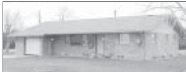
2006 Co. Rd. 1

3 bedrooms, single car detached garage, full basement, lots of storage.