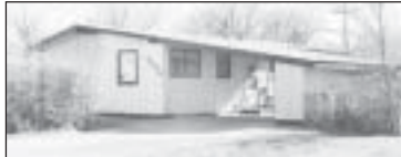
1080 E. 9th

5 bedrooms, full basement, car port, central air and heat.