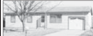
1121 Summer Sun

3 bedrooms ranch home with huge fenced back yard. Single car garage.