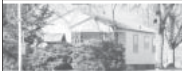
1485 W. 4th

2 bedrooms, full unfinished basement, subject to lease.