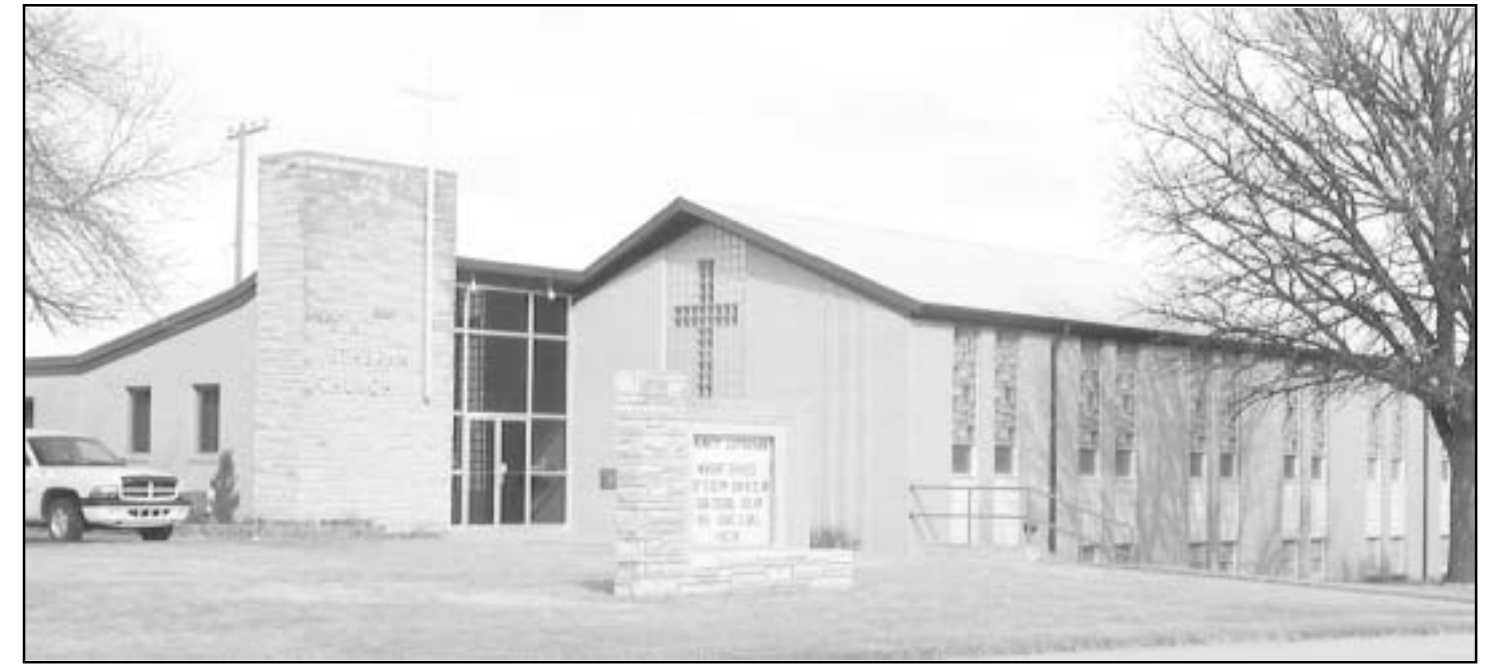
TRINITY LUTHERAN CHURCH, East 5th & Country Club, 462-3497, Worship, Saturday, 5:30 p.m.; Sunday School and Bible Class 9:15 a.m.; Worship,10:30 a.m.; Lutheran Hour on KXXX at 10 a.m.; KGCR at 2 p.m. website http://www.trinitycolbyks.org