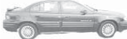
2001 Pontiac Gr Am •4 dr•spoiler, CD•36K miles