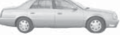
2003 Cadillac Deville •bronzemist•heated seats•18K miles