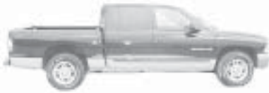
2001 Dodge Dakota •SLT•crew cab•39K miles