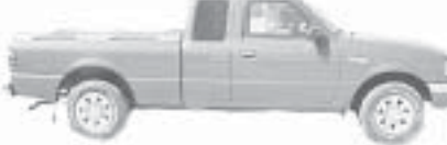
2001 Ford Ranger Ext cab•red•V-6•Quad cab