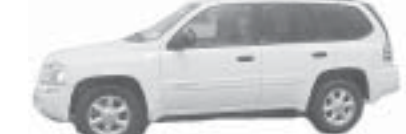
2002 GMC Envoy •white•SLE cloth•30K miles