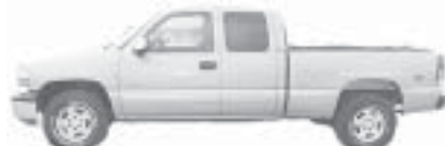
2001 Chevy Ext 4WD •silver•LT•32K miles