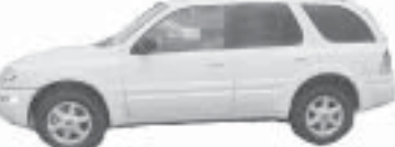
2003 Olds Bravada •white•gray leather•17K miles