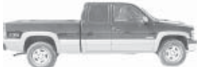
2001 Chevy Ext 4WD •black•LS•27K miles