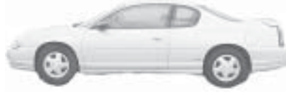
2001 Chevy Monte SS •sunroof•leather•43K miles