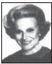
Abigail Van Buren