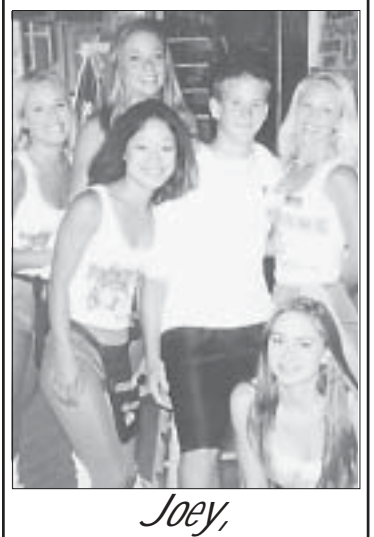
Hope your 17th Birthday is a Hoot!

The wife persuades the artist to Finally, if you mix history with talk her husband into a softer subject: the beguilement of a unicorn by a noblewoman. Chevalier meticulously describes the complex process of creating a tapestry and in the process the reader finds a romantic, beautiful story. How's that for a Valentine's Day read?