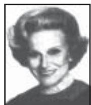
Abigail Van Buren

DEAR ABBY: My husband is helping me to write thank-you notes for the wedding presents we