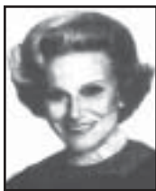
Abigail Van Buren

DEAR ABBY: My husband died one year ago. I wore a gray outfit to his funeral instead of the traditional one. I have the feeling that some of the people there thought it was strange. In recent years, I have no-