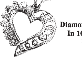
1/4 CT TW Diamond Heart Pendant In 10K Yellow Gold REG. $220.00 $109.95