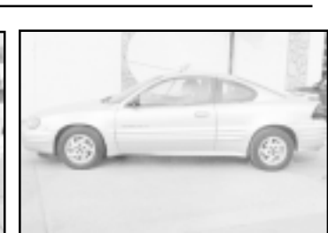
2002 Buick Century CUSTOM 2002 Pontiac Grand Am SE 31,000 Miles, 2 Door Coupe, Silver $13,800