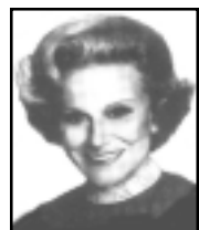
Abigail Van Buren