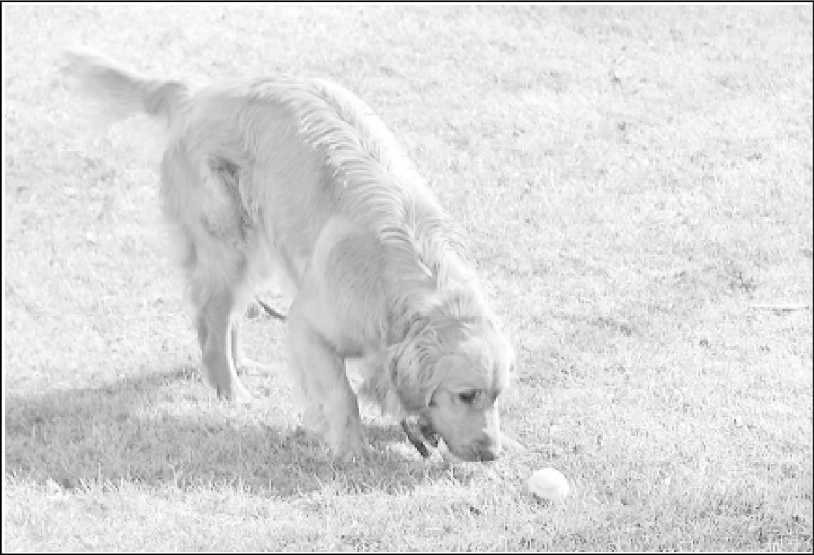
Remy the Golden Retriever helped out the high school tennis team gathering tennis balls Monday afternoon at Fike Park.