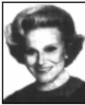
Abigail Van Buren

It took seven years, but I graduated from a university with a B.S. with honors and a 3.96 GPA. I was 44 years old and the first in my family to graduate from college. My entire family came to the ceremony. It was one of the proudest moments in my life.