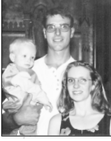
From: Hutfles Electric