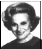
Abigail Van Buren