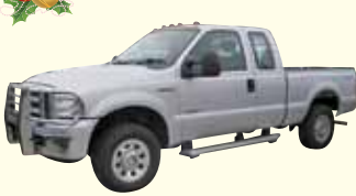
2005 Ford F-250 Supercab

Short Box, XLT Pkg, Diesel Automatic 4X4, Keyless Entry, PWR, Seat, Trailer Tow Pkg, 56,000, 1-Owner Miles Very Clean