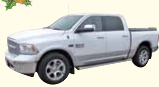
2013 Ram 1500 Crew Cab

Short Box Laramie Pkg, Hemi 4X4 Automatic, Heated And Cooled Seats, Navigation, DVD, Trailer Tow Pkg, Tonneau Cover, PWR, Sunroof Every Option Local 1-Owner