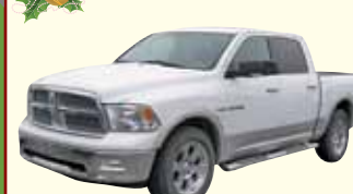
2010 Ram 1500 Crew Cab

Short Box Laramie Pkg, Hemi 4X4, Heated And Cooled Seats, Navigation, Reverse Camera, Remote Start, Loaded Local Trade