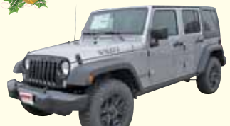
2015 Jeep Wrangler

Unlimited Sport 4X4 Automatic, Black 3-Piece Hard Top, Alpine Stereo With Subwoofer, Willys Special Edition