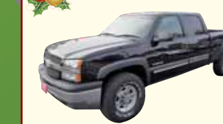
2003 Chevrolet 1500 HD Crew Cab

Short Box LT Pkg, 4X4, Keyless Entry, Alloy Wheels, Trailer Tow Pkg, Clean Local Trade