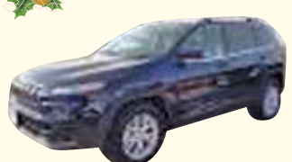
2014 Jeep Cherokee Latitude

4X4 Automatic, Keyless Entry, Sat Radio, U Connect Loaded