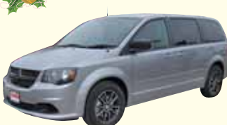
2015 Dodge Grand Caravan Quad

Seating With Stow N Go, Keyless Entry, Rear DVD, Uconnect, Premium Cloth Bucket Seats, Alloy Wheels MSRP $28,075