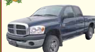
2009 Dodge Ram 2500 Quad Cab

Short Box SLT Pkg, Diesel 4X4 Automatic, Keyless Entry, Alloy Wheels, Trailer Tow Pkg, Clean Local 1-Owner Low Miles