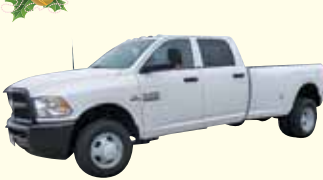
2015 Ram 3500 Crew Cab

Dually Diesel 4X4 Automatic, Tradesman Pkg, Keyless Entry, Trailer Tow Group, Reverse Camera Great Puller