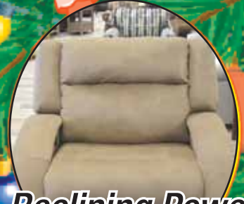
Reclining Power Chair & 1/2