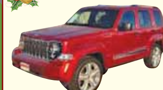
2012 Jeep Liberty Limited

Jet Pkg Heated Leather Seats, 4x4, PWR, Sunroof, Reverse Camera, Touch Screen, Sat Radio, Keyless Entry With Remote Start, 15,000 1-Owner Miles Mint Condition