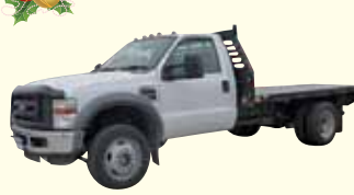
2008 Ford F-450 Reg-Cab

With Flatbed XL Pkg, Diesel 4X4 Automatic, New Tires, Run's And Drives Perfect