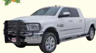
2014 Ram 3500 Mega Cab

Short Box Laramie Pkg, Diesel 4X4, Heated And Cooled Seats, PWR, Sunroof, Navigation, Rev Camera, 8.4", Radio Remote Start Local 1-Owner