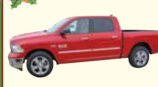
2015 Ram 1500 Crew Cab

Short Box SLT Pkg, Hemi 4X4, Remote Start, Heated Cloth Seats, Trailer Tow Group MSRP $46,035