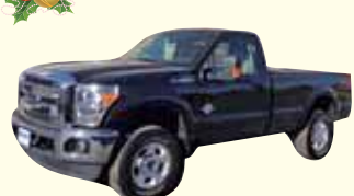
2014 Ford F-350 Reg-Cab

Long Box, Diesel 4X4 Automatic, XLT With FX4 Pkg, Tonneau Cover, Sat Radio, Reverse Camera, PWR, Seat, Keyless Entry, Loaded 11,000 Miles