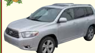
2008 Toyota Highlander

Sport Heated Leather Seats, AWD 3.5L V-6, Sport Pkg, Alloy Wheels, PWR, Sunroof, Keyless Entry, Very Clean Local Trade