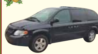
2007 Dodge Grand Caravan

SXT Pkg Quad Seating With Stow N Go, Seating Rear Heat And A/C PWR., Sliding Doors And Liftgate, Clean Local Trade