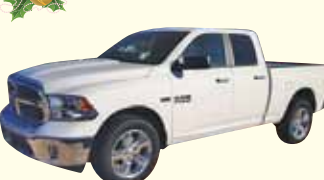
2014 Ram 1500 Quad Cab

Short Box Hemi 4X4, SLT Big Horn Pkg, Keyless Entry, 20" Chrome Wheels, Trailer Tow Group