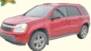
2005 Chevrolet Equinox LT

Pkg 4X4, Heated Leather Seats, PWR, Sunroof, Alloy Wheels, XM And Onstar, Clean Local Trade