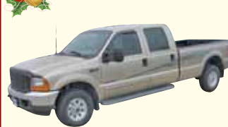
2001 Ford F-250 Crew Cab

Long Box XLT Pkg, 7.3L Powerstroke Diesel Automatic 4X4, Keyless Entry, Trailer Tow Pkg, Alloy Wheels, New Tires, Clean Local Trade