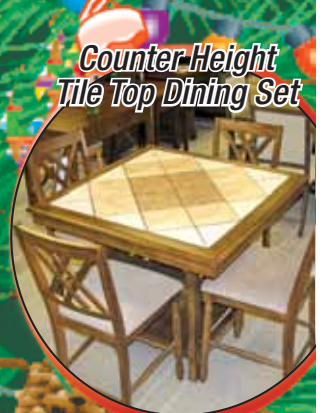
Counter-Height Tile Top Dining Set