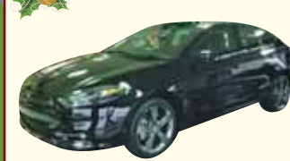
2014 Dodge Dart GT

Heated Leather Seats, Touch Screen, Stereo Sat, Reverse Camera, Remote Start, Hyper Black 18" Wheels, Loaded MSRP $23,635