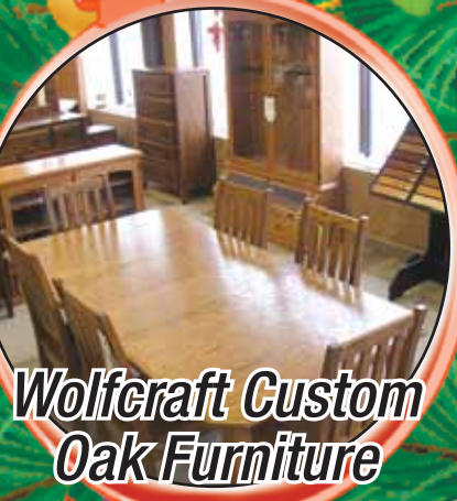
Wolfcraft Custom Oak Furniture