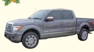
2012 Ford F-150 Supercrew

Platinum Pkg, Ecoboost 4X4, Heated And Cooled Seats, PWR, Sunroof, Navigation, Remote Start, Power Boards, New Tires, Low miles Clean Local 1-Owner