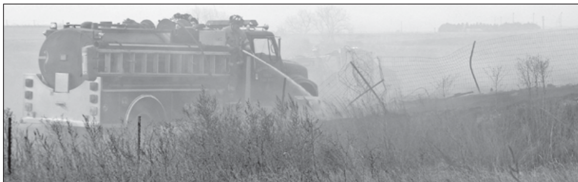
Sherman Rural firefighters poured water onto a small grass fire near the county landfill on Sunday. The fire started when sparks from a tree pit blew into a grassy area. The fire ended up burning about three acres of grass. Several other fires happened around the county over the past week.