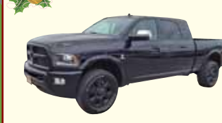
2015 Ram 2500 Mega Cab

Short Box Laramie Pkg, Diesel Auto 4X4, Heated And Cooled Seats, PWR, Sunroof, Remote Start, Navigation, Every Option Black Out Edition MSRP $67,485