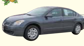
2009 Nissan Altima S 4CYL

Automatic Push Button Start, Clean Local Trade, Amazing Car For