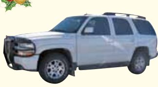
2003 Chevrolet Tahoe

Z-71 Pkg, Heated Leather Seats, PWR, Sunroof, DVD Keyless Entry, XM And Onstar, Clean Local Trade