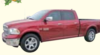
2014 Ram 1500 Crew Cab

Short Box Laramie Pkg, Hemi 4X4, Heated And Cooled Seats, 4-Corner Air Suspension, Navigation, Remote Start Loaded MSRP $51,330