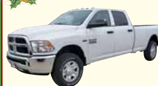
2015 Ram 3500 Crew Cab

Long Box Tradesman Pkg, 6.4L Hemi 4X4 Automatic, Keyless Entry, Reverse Camera, Chrome Appearance Group MSRP $44,450