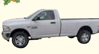
2014 Ram 2500 Reg-Cab

Long Box Tradesman Pkg, 6.4L Hemi 4X4 Automatic, Keyless Entry, U-Connect Reverse Camera, Chrome Appearance Pkg MSRP $39,355