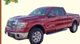
2013 Ford F-150 Super Cab

Short Box XLT Pkg, 5.0L 4X4, Trailer Tow Pkg, Chrome Appearance Pkg, Reverse Camera, Sat Radio, PWR, Seat, Keyless Entry, Clean Local Trade