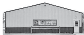
Southwind Steakhouse & Saloon 115 N. Kansas Selden, KS Turn-key business - $165,000