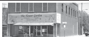
Commercial Building 200 Center Oakley, KS Price Reduced - $32,500