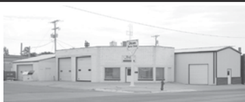
Dave's Body Shop 228 Center Oakley, KS Turn-key business - $165,000