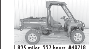
1,825 miles, 327 hours, #49718 $10,800