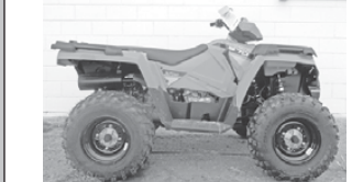
Solar Red. #53084. $6,199