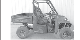
Sage Green, #49882 $13,799