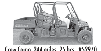
Crew Camo, 244 miles, 25 hrs., #52970 $9,900