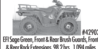
#42903 EFI Sage Green, Front & Rear Brush Guards, Front & Rear Rack Extensions, 98.2 hrs., 1,094 miles $6,300