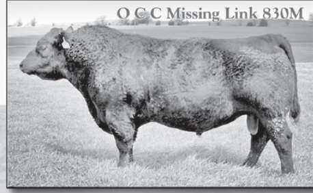
ASA# 2300121 Selling our best set of black bulls to date. Featuring sons of O C C Missing Link, Final Answer, Manifest, Stetson and Little Bear.

Your Western Kansas source for SimGenetics