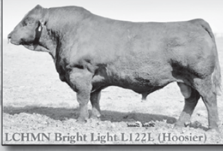
ASA# 2110803 Twelve red bulls sell featuring a herdsire prospect by Hoosier. Other featured sires include Mission Statement, Red Iron and DX Wonderboy.