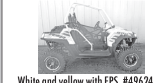
White and yellow with EPS, #49624 $14,999