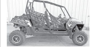
#49580: Orange Madness. $19,599