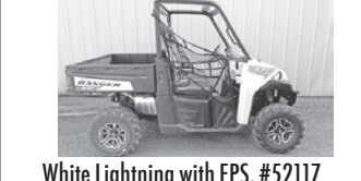
White Lightning with EPS, #52117 $14,599