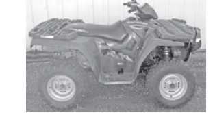
#49361: 475 hrs. $3,500