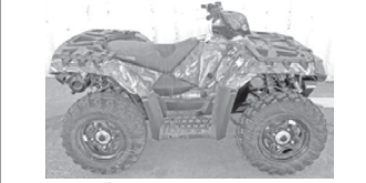
Camo with EPS, #50994 $8,399