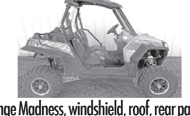
Orange Madness, windshield, roof, rear panel, 1,200 miles, 130 hrs, #51059 $13,900