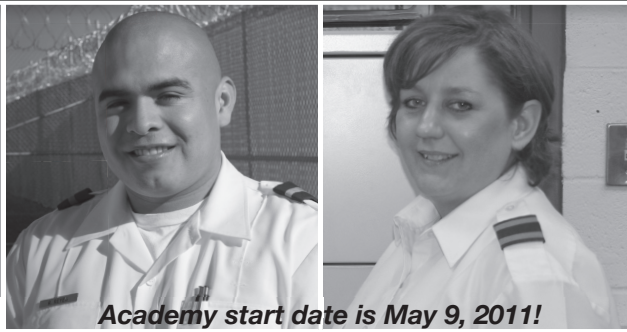
Academy start date is May 9, 2011!

Kit Carson Correctional Center - Burlington, CO - (719) 346-9450