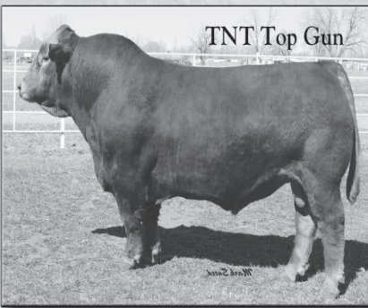
Selling a select set of purebreds by Top Gun, Arapahoe Gold, and Poker Face

Your Western Kansas source for SimGenetics