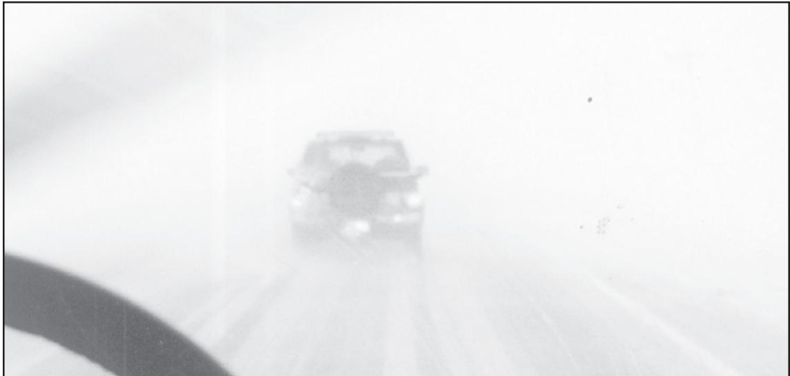
WOW — As you can see, visibility was close to zero during the blizzard.