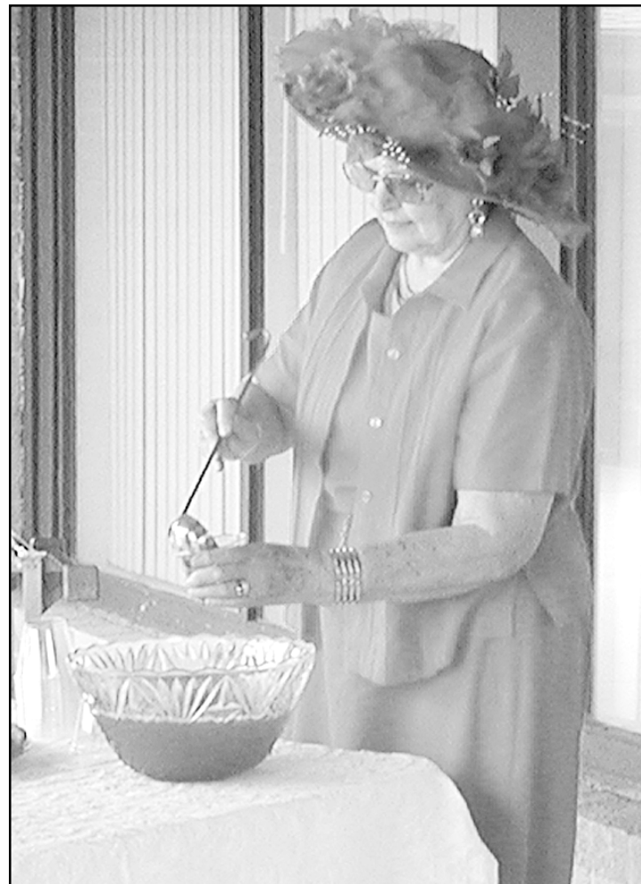
THE MEMORIAL GARDEN dedication at the Good Samaritan Village was held Thursday.