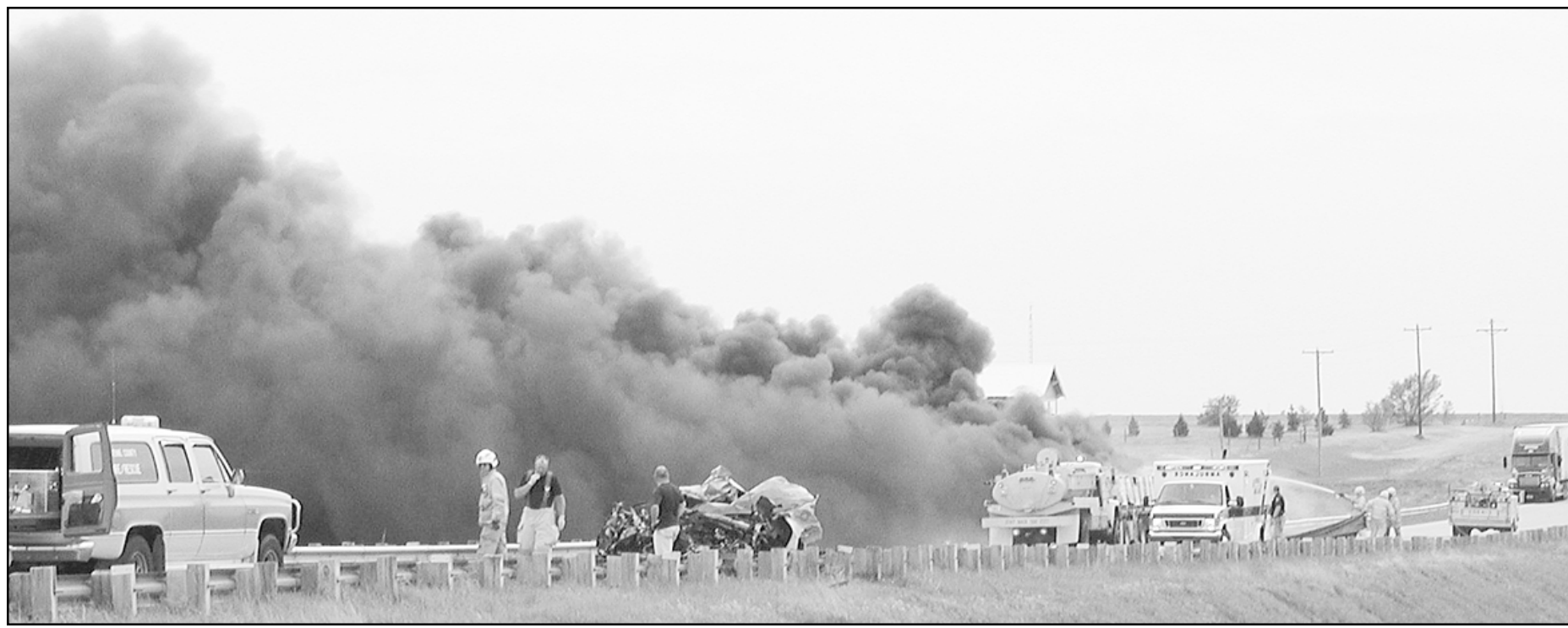
TRAGEDY STRIKES — A rig hauling shingles and an automobile collided on U.S. 36 about two miles from the Colorado border early Tuesday evening. The driver of the car was killed in the collision. The truck driver was taken to the hospital in St. Francis. Kansas Highway Patrol is investigating the accident.