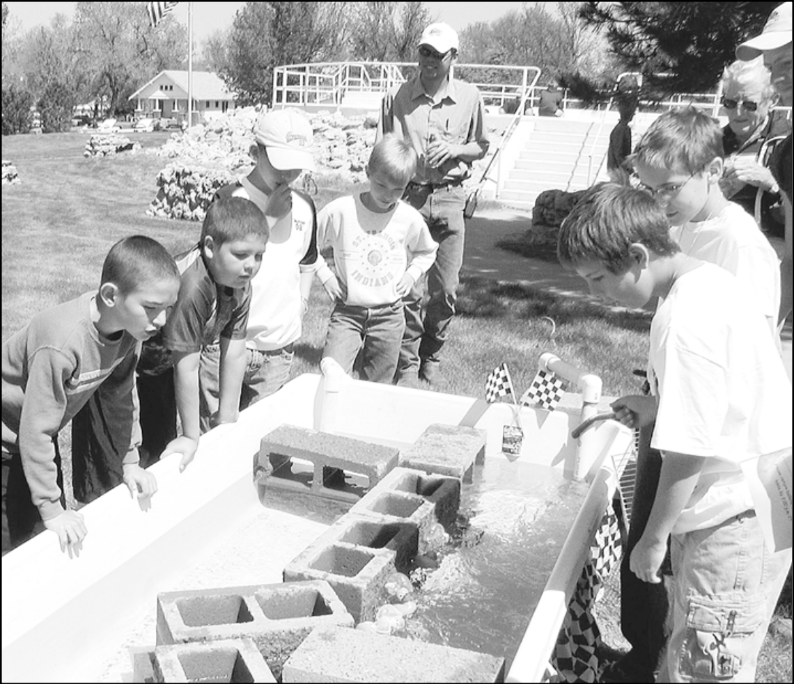
DUCK RACES were some of the games enjoyed by many of the youth during the ‘Saturday in the Park’ car show. The game is sponsored by the Association to Benefit Cheyenne County.