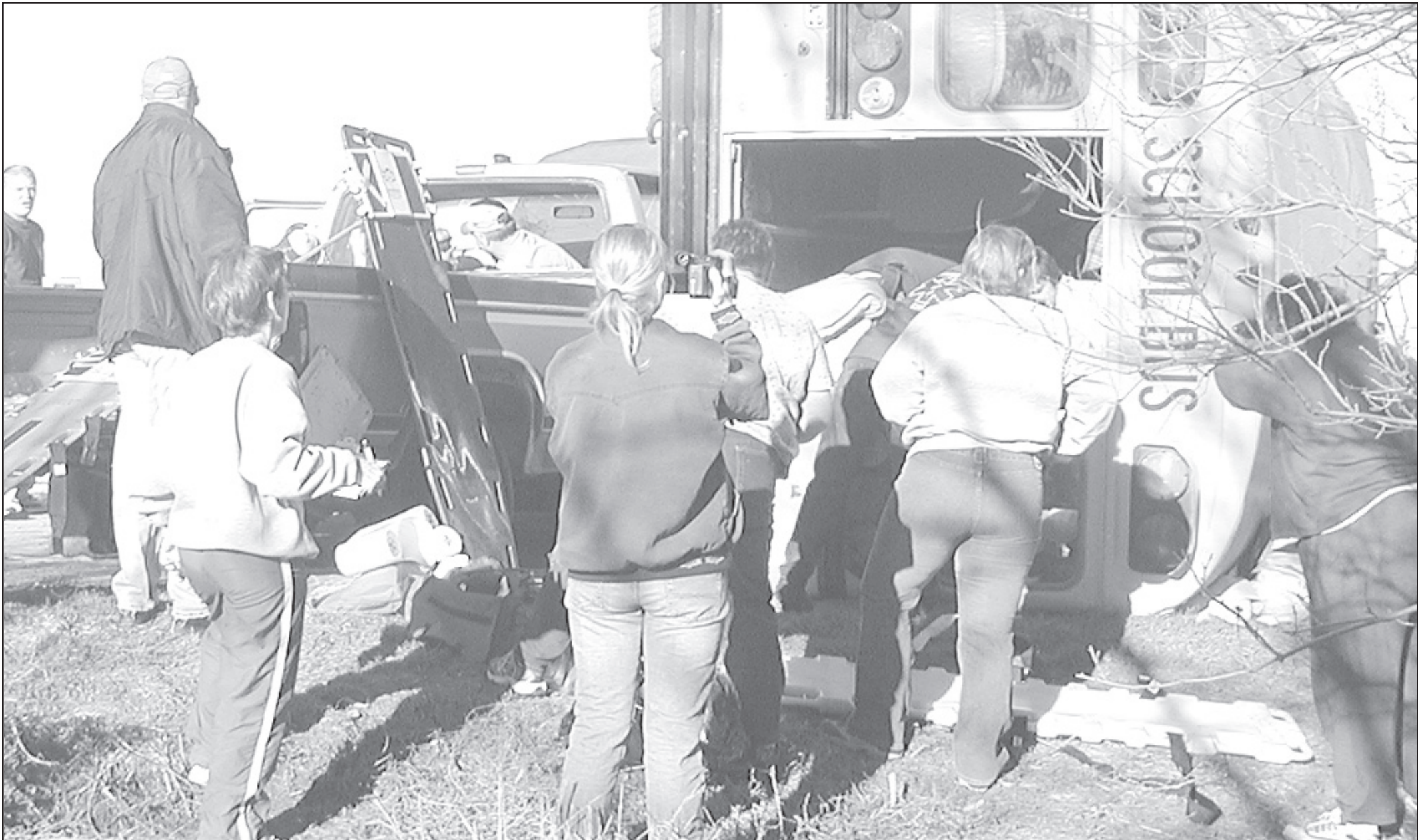
A MOCK ACTION was held Dec. 28 and emergency medical technicians scrambled to the accident. The bus was turned over and technicians worked to get inside.