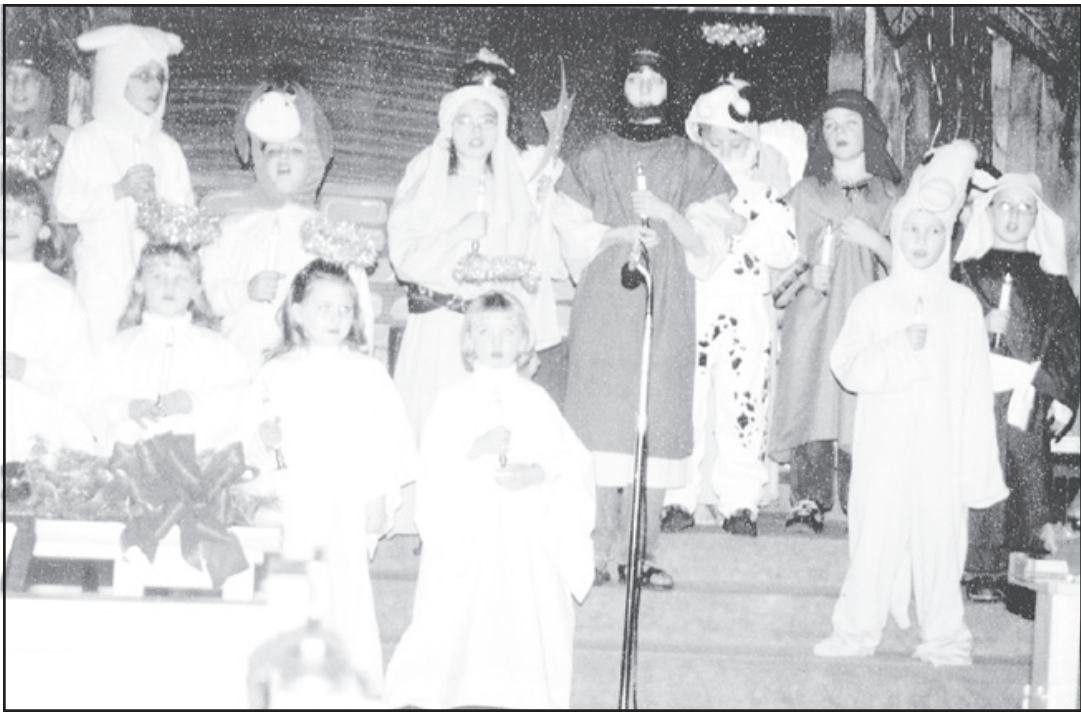
CHILDREN'S VOICES WILL BE HEARD — The United Methodist Church Children's Christmas program will be presenting the Story of Christmas at 6:30 p.m. on Sunday. Following the program, there will be a time of sharing, fellowship and Christmas tea in the fellowship hall. Everyone is welcome.