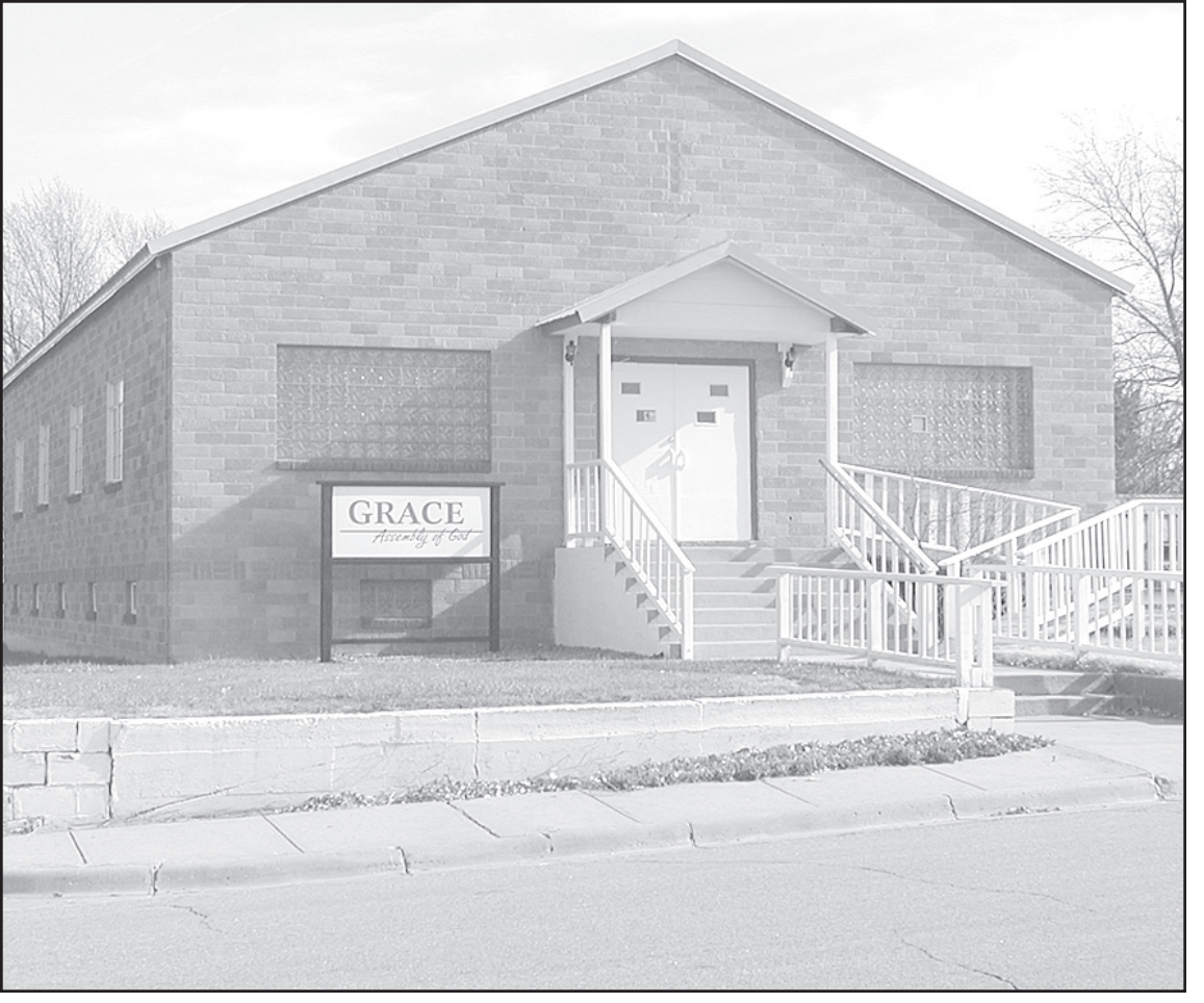
ASSEMBLY OF GOD CHURCH will celebrate 70 years on Sunday.